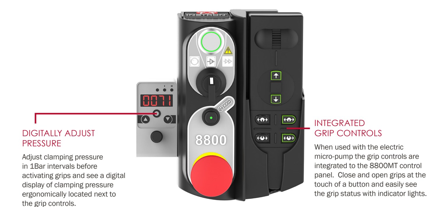
Clear Digital Display

In order to load a specimen in both tension and compression the specimen ends must preloaded to remove backlash in the loadstring as the specimen goes from being under tensile and into compressive load. The preload must be adjusted depending on the specimen geometry or the test forces involved. To adjust the pre-load, you need to change the clamping pressure. In order to achieve precise and repeatable Class 5 Alignment the clamping pressure should be applied smoothly and in a controlled and repeatable manner.