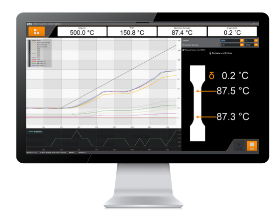
3117-301 Furnace Controller Software