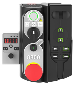
3117-503 Electrically Operated Pump with One-Touch Operation