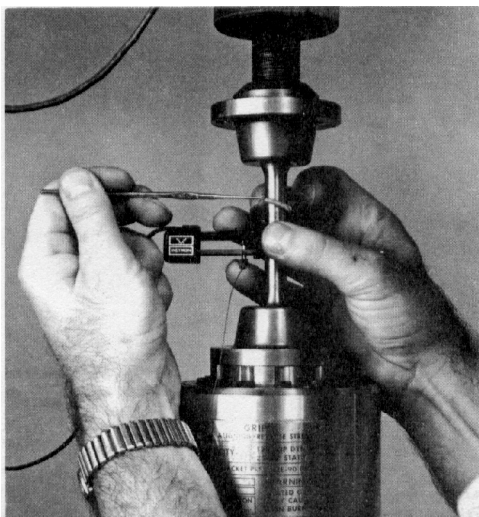
Figure 2-3. Installing the Upper Clamp