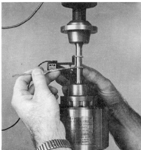
Figure 2-4. Installing the Lower Clamp

slack in the cable and either tape it to the load frame column of other fixed object or use the magnetic cleat to support the cable. Leave a loop or some slack in the cable so that the extensometer is free to move without being pulled by the cable. This is especially important when operating the system in strain control, since cable movement and resulting extensometer vibration will cause erratic control.