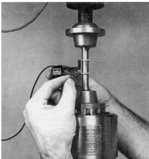
Figure 2-5. Removing the Gauge Length Pin