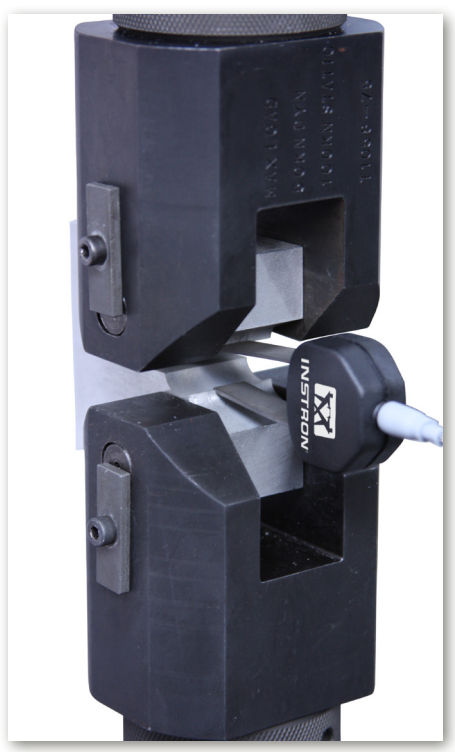
2670-132 COD Gauge fitted to a CT25 specimen