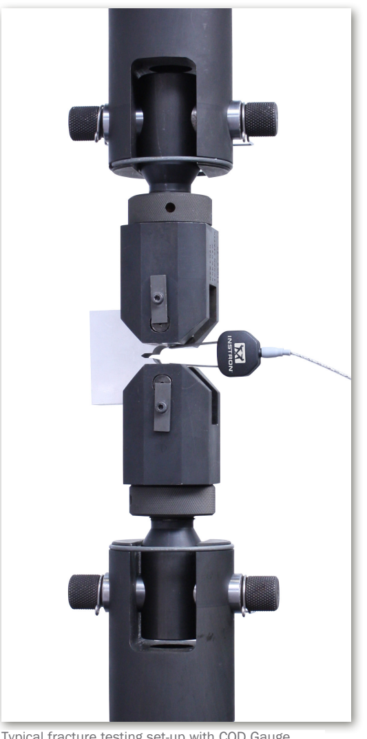
Typical fracture testing set-up with COD Gauge